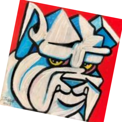
The Red Dog Gallery is open Tuesday - Friday 11 - 6, and Saturday 11 - 4