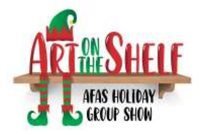
Exhibit will run thru January 28th

If you haven't had an opportunity to see the "Art on the Shelf" exhibit at the Red Dog Gallery, you still have time.