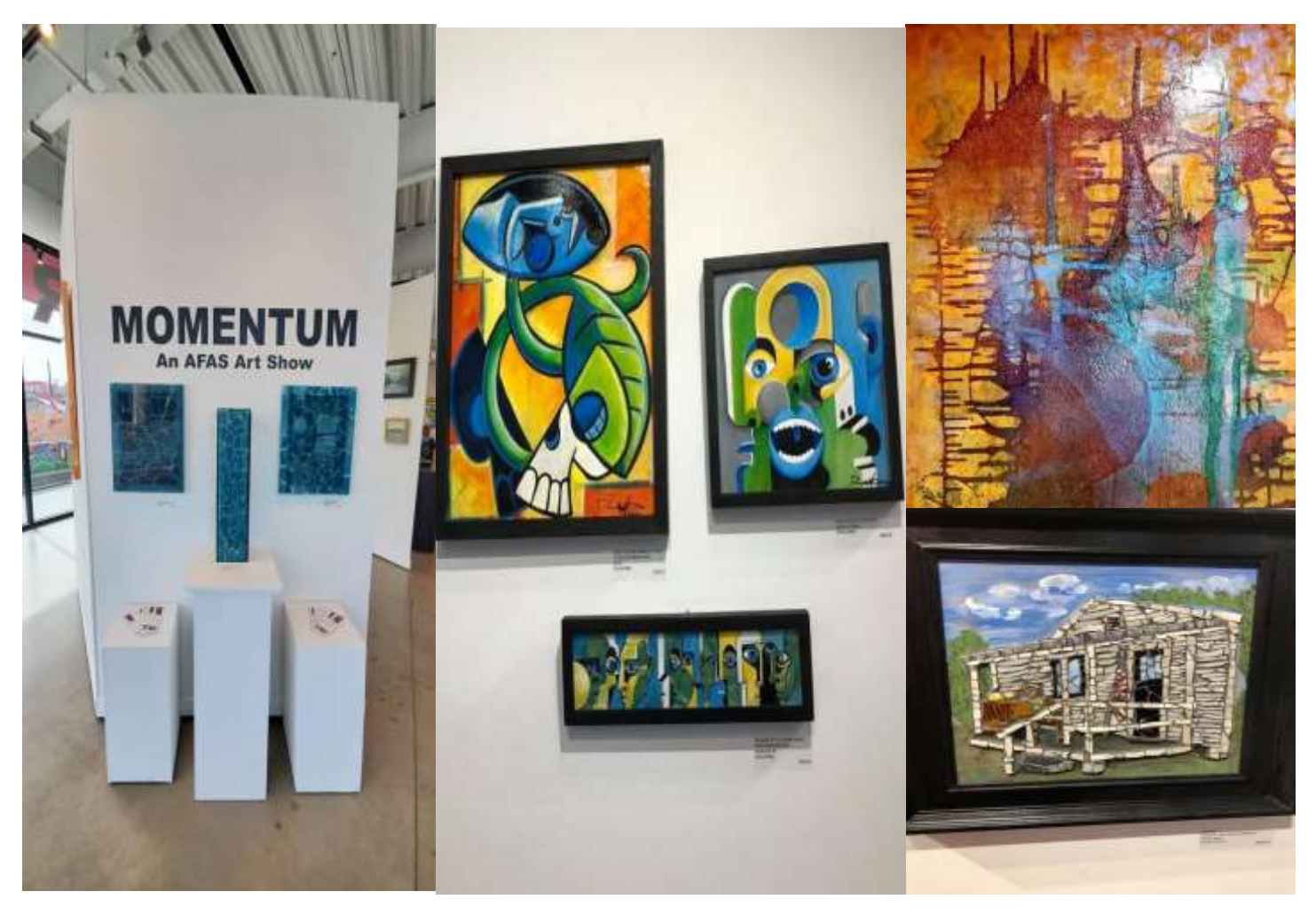
The Red Dog Gallery is open Tuesday - Friday 11 - 6, and Saturday 11 - 4

Here are just a few of the wonderful works in the show... Come on down and see these and many other beautiful pieces of art. You won't be disappointed!