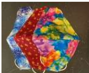
Handmade face masks