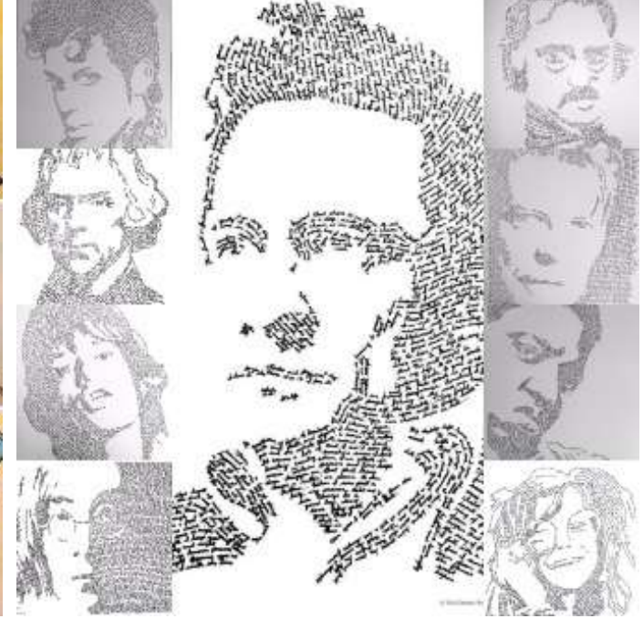
These 9 acrylic and ink 4 X 4 works will be available in the Red Dog Gallery starting August 4th.