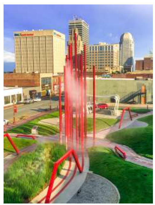
Artivity on the Green

Stitch Design Shop worked with AFAS (Art For Art's Sake) to develop the park which was dedicated May 9, 2015.