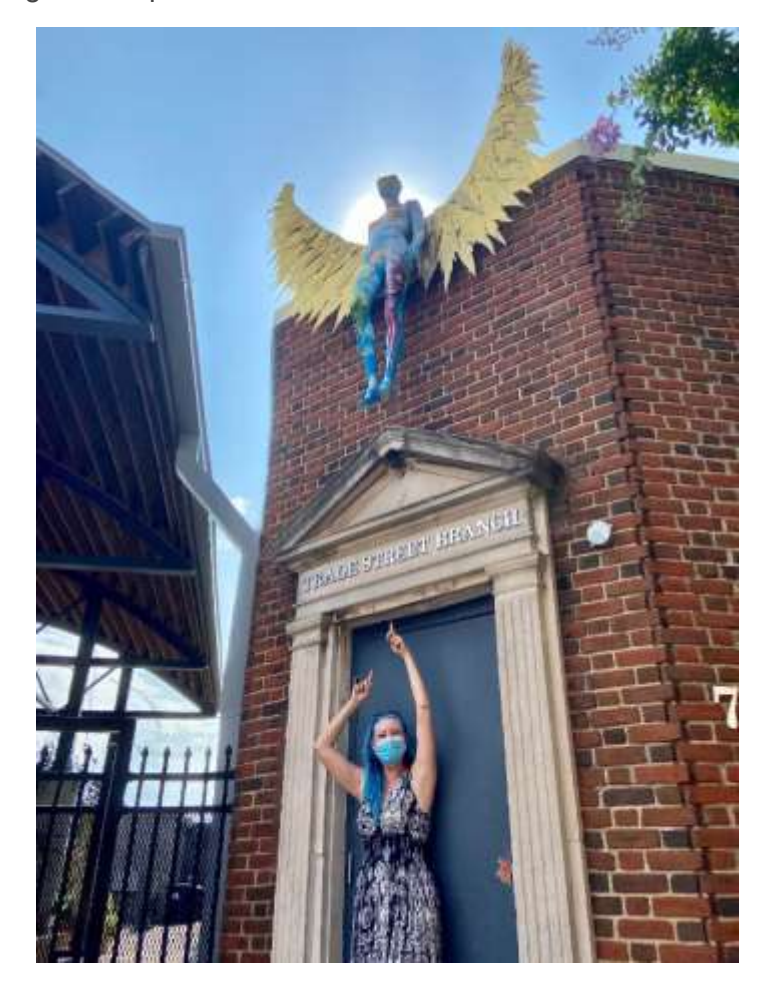
As you can see, masking and social distancing was taking place during the installation of this piece!